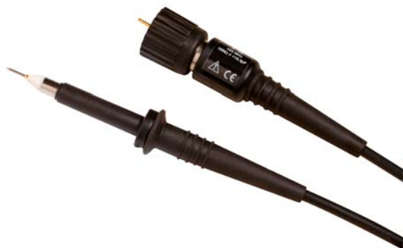
Model 6551 Microline Passive Oscilloscope Probe with Readout Actuator